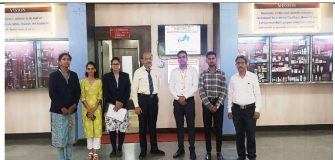
RSCOPR Team with Pratham Infotech Foundation Members