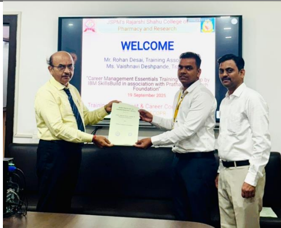
MOU signing Program between Pratham Infotech Foundation, Mumbai and RSCOPR, Tathawade.